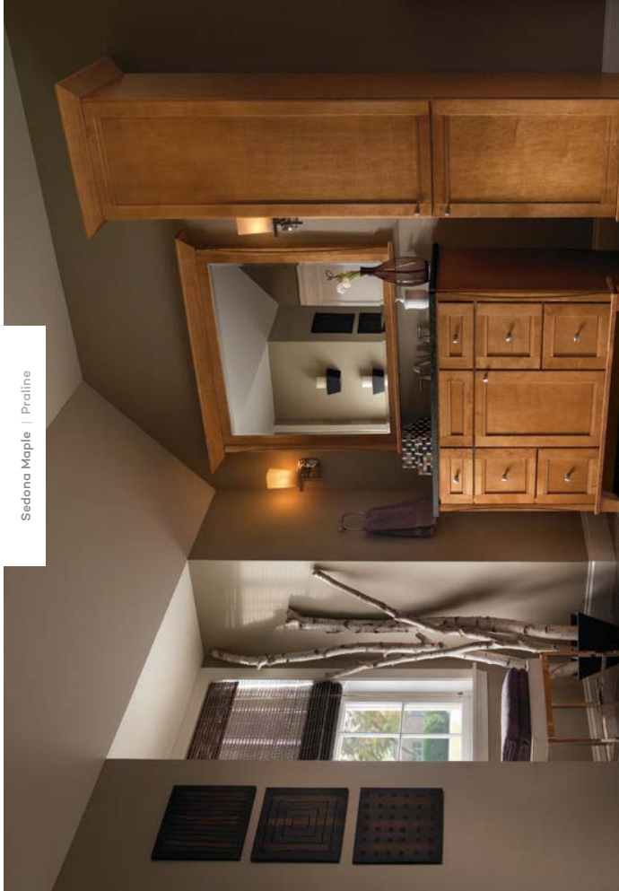
Sedona Maple | Praline

At KraftMaid, we're always looking for problems to solve. So naturally, we took everything we've learned about making life better in the kitchen and applied it to the bathroom. For example, we talked to people about "that drawer" in every vanity, the one with the jumble of small items at the bottom—our wood-tiered storage is a Bath Innovation specifically designed to maximize that space.