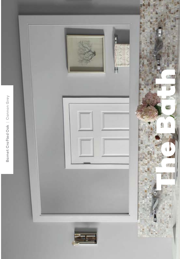
Barnet Crafted Oak | Cannon Grey