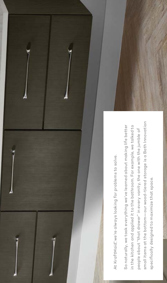
Putnam Cherry | Husk Suede